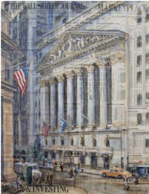
New York Stock Exchange Beau Redmond Area VI