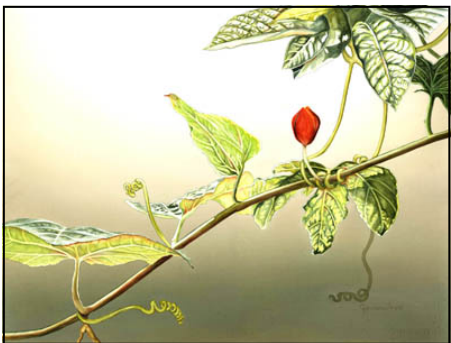
"Sleeping Beauty" Christine Reichow Area VII